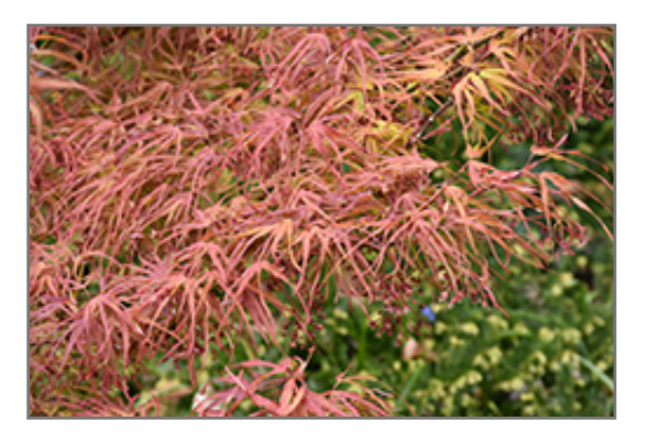
Villa Taranto Japanese Maple foliage