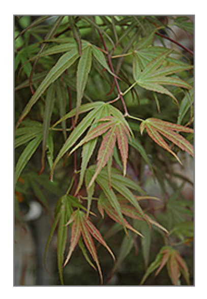
Villa Taranto Japanese Maple foliage

11035 York Road Cockeysville, MD 21030 410.527.0700 www.valleyviewfarms.com www.facebook.com/ValleyViewFarms