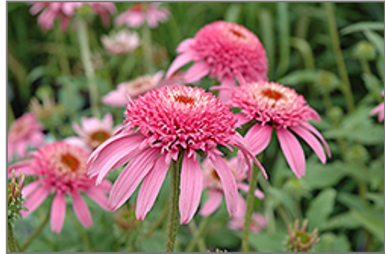
Cone-fections Pink Double Delight Coneflower flowers

Cone-fections Pink Double Delight Coneflower is recommended for the following landscape applications;