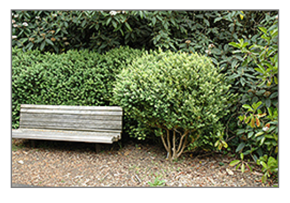
Common Boxwood