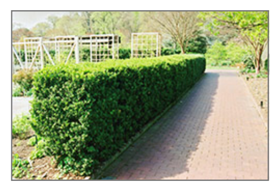
Common Boxwood