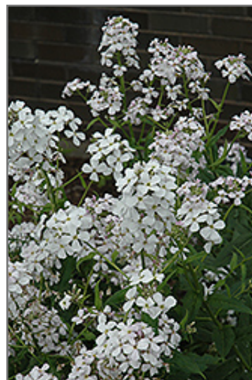
Dame's Rocket flowers