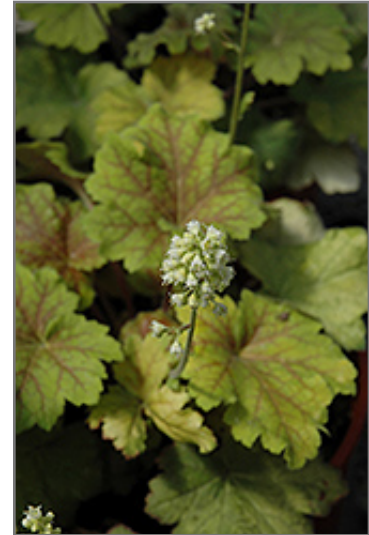
Electra Coral Bells flowers

Electra Coral Bells is recommended for the following landscape applications;