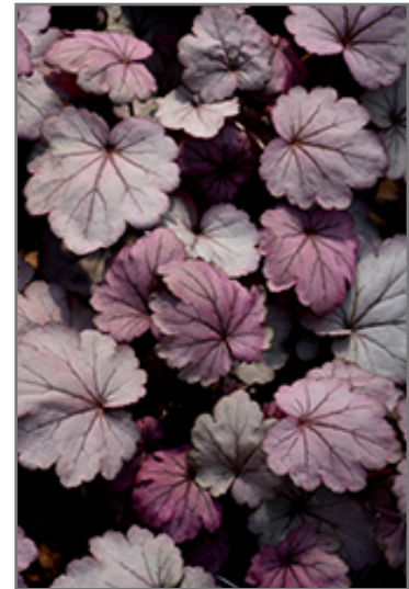
Sugar Plum Coral Bells foliage

Sugar Plum Coral Bells is recommended for the following landscape applications;