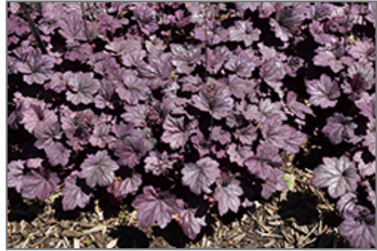
Sugar Plum Coral Bells

Sugar Plum Coral Bells will grow to be about 12 inches tall at maturity extending to 24 inches tall with the flowers, with a spread of 18 inches. When grown in masses or used as a bedding plant, individual plants should be spaced approximately 15 inches apart. Its foliage tends to remain dense right to the ground, not requiring facer plants in front. It grows at a medium rate, and under ideal conditions can be expected to live for approximately 10 years. As an evergreen perennial, this plant will typically keep its form and foliage year-round.