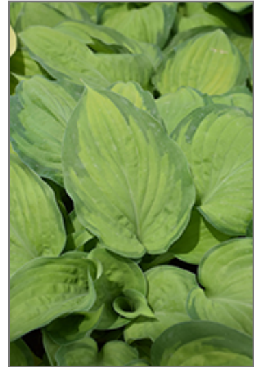
Paradigm Hosta foliage

Paradigm Hosta will grow to be about 10 inches tall at maturity extending to 18 inches tall with the flowers, with a spread of 4 feet. When grown in masses or used as a bedding plant, individual plants should be spaced approximately 4 feet apart. Its foliage tends to remain low and dense right to the ground. It grows at a medium rate, and under ideal conditions can be expected to live for approximately 10 years. As an herbaceous perennial, this plant will usually die back to the crown each winter, and will regrow from the base each spring. Be careful not to disturb the crown in late winter when it may not be readily seen!