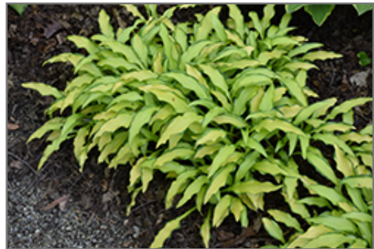
Kabitan Hosta