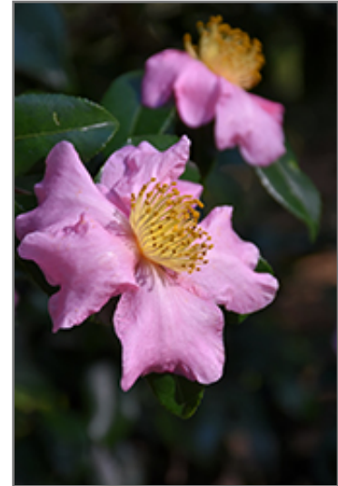
Winter's Star Camellia flowers