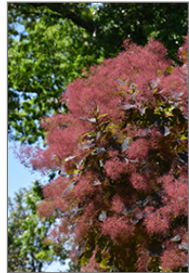
Grace Smokebush flowers