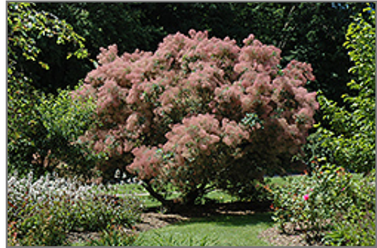
Grace Smokebush in bloom

Grace Smokebush is recommended for the following landscape applications;