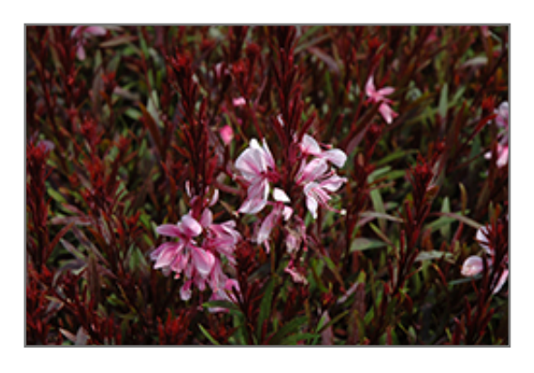
Passionate Blush Gaura flowers