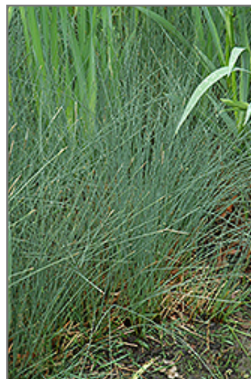
Soft Rush

Soft Rush will grow to be about 3 feet tall at maturity, with a spread of 12 inches. Its foliage tends to remain dense right to the ground, not requiring facer plants in front. It grows at a fast rate, and under ideal conditions can be expected to live for approximately 8 years. As an herbaceous perennial, this plant will usually die back to the crown each winter, and will regrow from the base each spring. Be careful not to disturb the crown in late winter when it may not be readily seen!