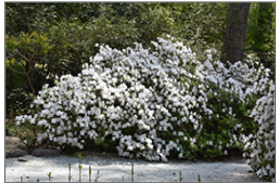
Delaware Valley White Azalea in bloom