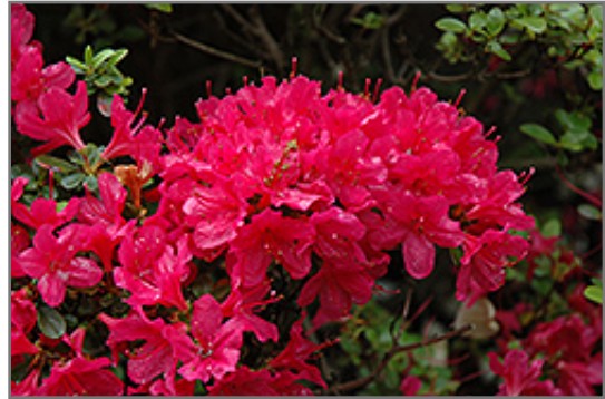
Hino Crimson Azalea flowers

This shrub does best in full sun to partial shade. You may want to keep it away from hot, dry locations that receive direct afternoon sun or which get reflected sunlight, such as against the south side of a white wall. It requires an evenly moist well-drained soil for optimal growth, but will die in standing water. It is very fussy about its soil conditions and must have rich, acidic soils to ensure success, and is subject to chlorosis (yellowing) of the foliage in alkaline soils. It is somewhat tolerant of urban pollution, and will benefit from being planted in a relatively sheltered location. Consider applying a thick mulch around the root zone in winter to protect it in exposed locations or colder microclimates. This particular variety is an interspecific hybrid.