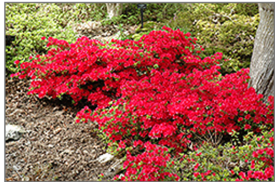
Hino Crimson Azalea in bloom