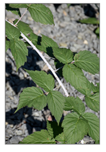
Bristol Raspberry fruit