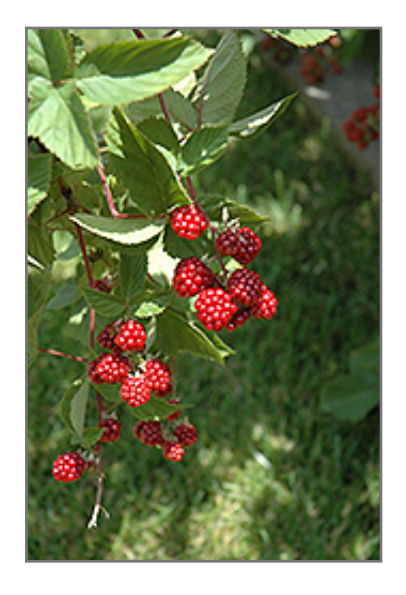
Heritage Raspberry fruit

Heritage Raspberry has rich green deciduous foliage on a plant with an upright spreading habit of growth. The fuzzy oval compound leaves do not develop any appreciable fall color. It features an abundance of magnificent red berries from early summer to early fall.