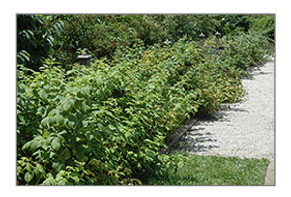
Heritage Raspberry