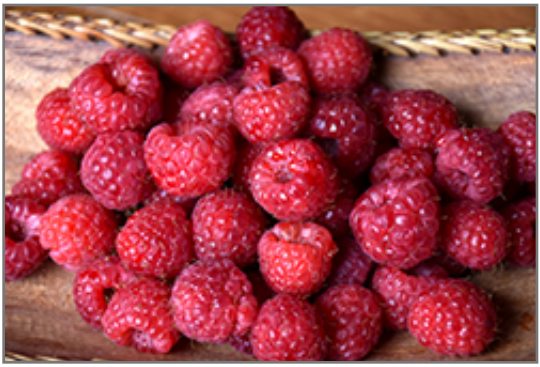
Heritage Raspberry fruit

Aside from its primary use as an edible, Heritage Raspberry is sutiable for the following landscape applications;