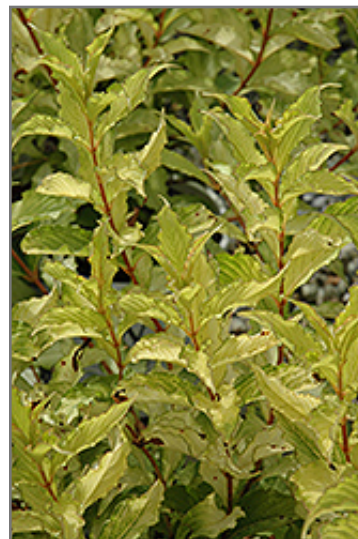
Ghost Weigela foliage