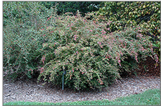
Edward Goucher Abelia in bloom