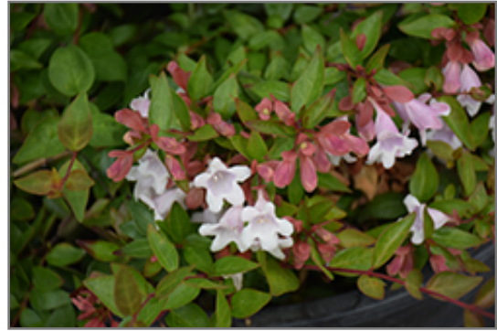
Edward Goucher Abelia flowers

Edward Goucher Abelia is recommended for the following landscape applications;