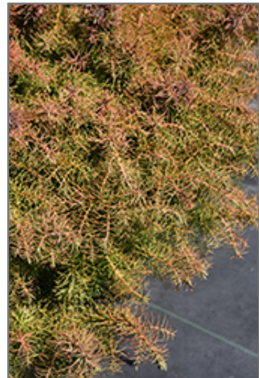
Mushroom Japanese Cedar foliage