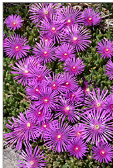
Purple Ice Plant flowers

Purple Ice Plant is recommended for the following landscape applications;