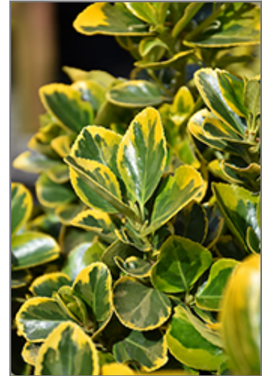
Gold Variegated Japanese Euonymus foliage