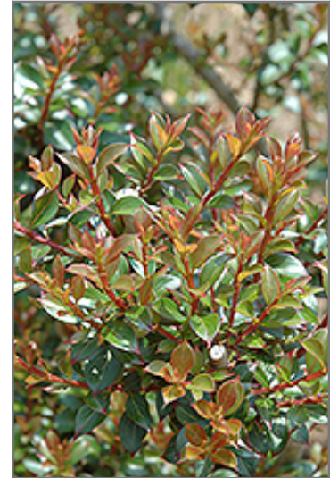
Pocomoke Crapemyrtle foliage

Pocomoke Crapemyrtle makes a fine choice for the outdoor landscape, but it is also well-suited for use in outdoor pots and containers. Because of its height, it is often used as a 'thriller' in the 'spiller-thriller-filler' container combination; plant it near the center of the pot, surrounded by smaller plants and those that spill over the edges. It is even sizeable enough that it can be grown alone in a suitable container. Note that when grown in a container, it may not perform exactly as indicated on the tag - this is to be expected. Also note that when growing plants in outdoor containers and baskets, they may require more frequent waterings than they would in the yard or garden.