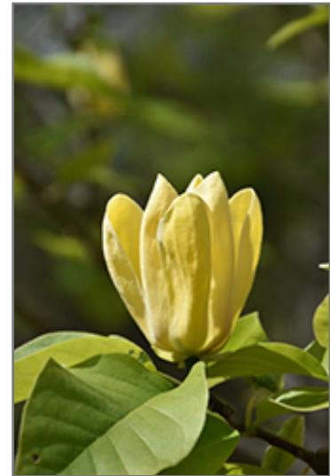
Yellow Bird Magnolia flowers