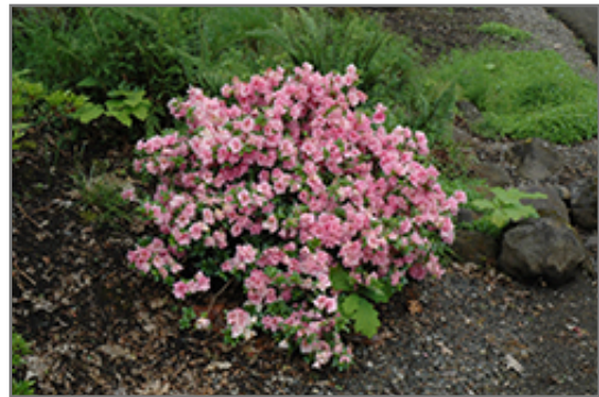
Gumpo Pink Azalea in bloom