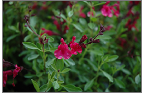
Furman's Red Texas Sage flowers

This is a relatively low maintenance plant, and should only be pruned after flowering to avoid removing any of the current season's flowers. It is a good choice for attracting bees, butterflies and hummingbirds to your yard, but is not particularly attractive to deer who tend to leave it alone in favor of tastier treats. It has no significant negative characteristics.