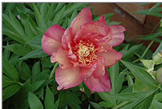
Kopper Kettle Peony flowers