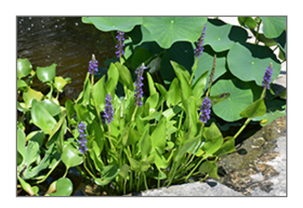
Pickerelweed in bloom