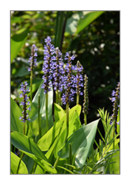
Pickerelweed flowers