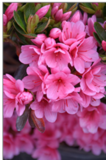
Coral Bells Azalea flowers