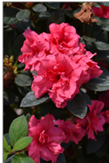
Encore Autumn Rouge Azalea flowers

Encore Autumn Rouge Azalea will grow to be about 4 feet tall at maturity, with a spread of 4 feet. It tends to be a little leggy, with a typical clearance of 1 foot from the ground. It grows at a slow rate, and under ideal conditions can be expected to live for 40 years or more.