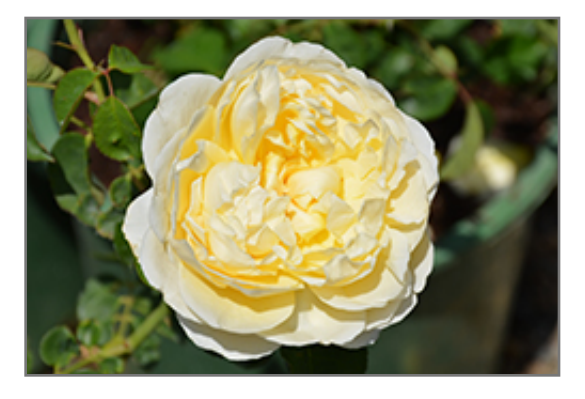
Charlotte Rose flowers

11035 York Road Cockeysville, MD 21030 410.527.0700 www.valleyviewfarms.com www.facebook.com/ValleyViewFarms