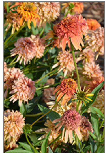
Cone-fections Marmalade Coneflower flowers