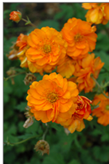
Fire Storm Avens flowers

Fire Storm Avens is recommended for the following landscape applications;