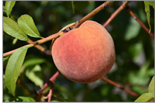
Redhaven Peach fruit

Redhaven Peach is covered in stunning clusters of fragrant pink flowers along the branches in early spring, which emerge from distinctive rose flower buds before the leaves. It has dark green deciduous foliage. The narrow leaves turn yellow in fall. The fruits are showy yellow drupes with a red blush, which are carried in abundance in mid summer. The fruit can be messy if allowed to drop on the lawn or walkways, and may require occasional clean-up.