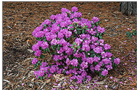
Compact P.J.M. Rhododendron in bloom