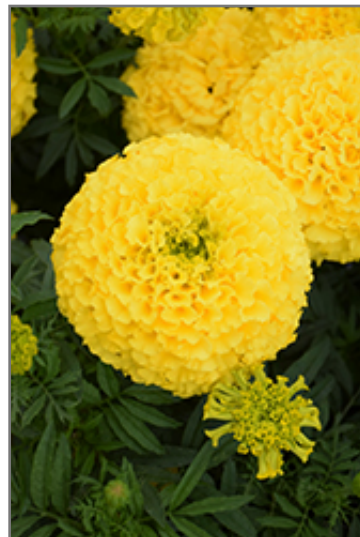
Marvel Yellow Marigold flowers

Marvel Yellow Marigold is recommended for the following landscape applications;