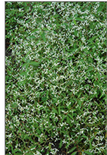
Breathless White Euphorbia flowers