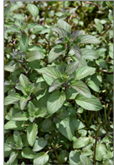
Water Mint foliage

Aside from its primary use as an edible, Water Mint is suitable for the following landscape applications;