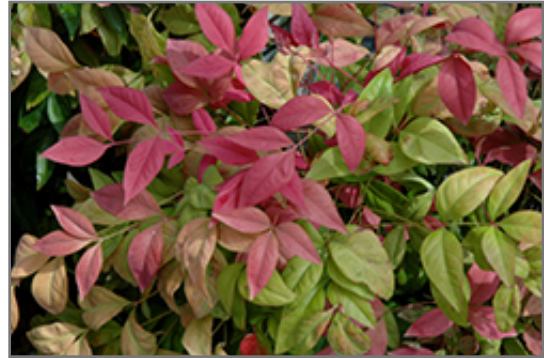
Blush Pink Nandina foliage

Blush Pink Nandina is recommended for the following landscape applications;