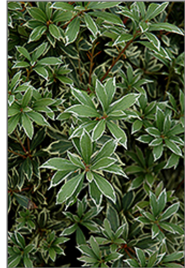
Little Heath Japanese Pieris foliage