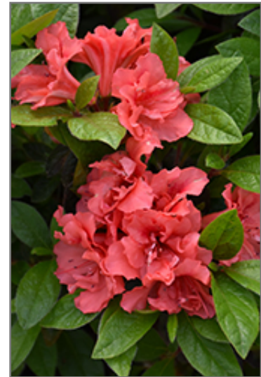
Encore Autumn Monarch Azalea flowers