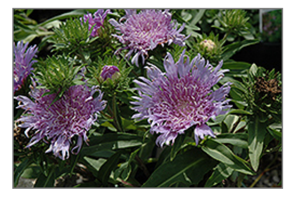
Klaus Jelitto Aster flowers