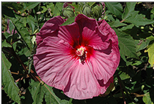
Summerific Berrylicious Hibiscus flowers