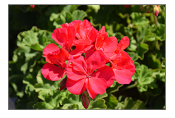
Americana Cherry Rose Geranium flowers