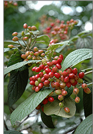
Alleghany Viburnum fruit

This shrub does best in full sun to partial shade. It prefers to grow in average to moist conditions, and shouldn't be allowed to dry out. It is not particular as to soil type or pH. It is highly tolerant of urban pollution and will even thrive in inner city environments. This particular variety is an interspecific hybrid.