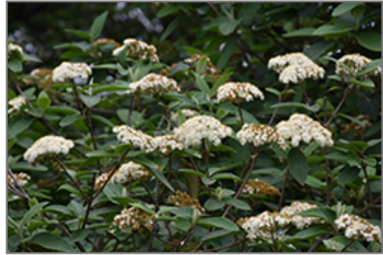
Alleghany Viburnum flowers

Alleghany Viburnum is recommended for the following landscape applications;