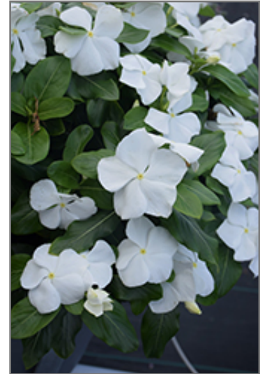
Titan Pure White Vinca flowers

Titan Pure White Vinca is recommended for the following landscape applications;