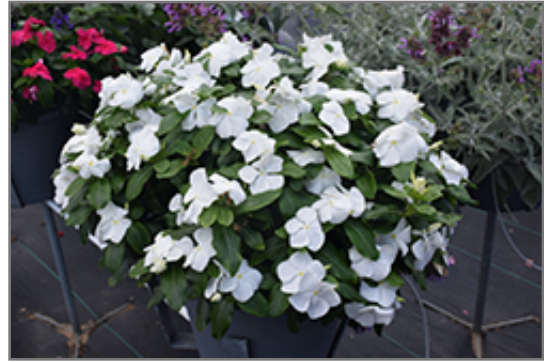
Titan Pure White Vinca in bloom

Titan Pure White Vinca will grow to be about 14 inches tall at maturity, with a spread of 12 inches. Its foliage tends to remain dense right to the ground, not requiring facer plants in front. Although it's not a true annual, this fast-growing plant can be expected to behave as an annual in our climate if left outdoors over the winter, usually needing replacement the following year. As such, gardeners should take into consideration that it will perform differently than it would in its native habitat.