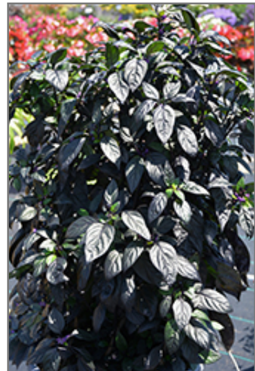
Black Pearl Ornamental Pepper