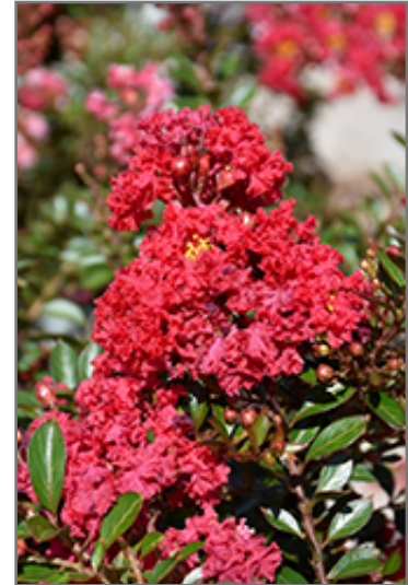
Cherry Dazzle Crapemyrtle flowers

Cherry Dazzle Crapemyrtle is recommended for the following landscape applications;