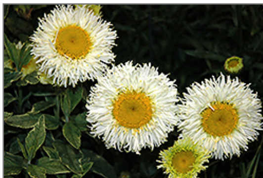
Realflor Real Galaxy Shasta Daisy flowers