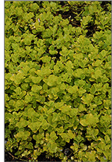
Golden Creeping Jenny foliage

Golden Creeping Jenny is recommended for the following landscape applications;