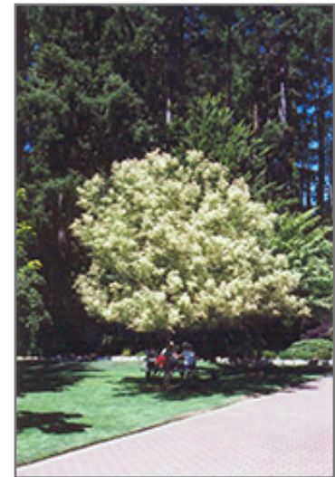
Flamingo Boxelder